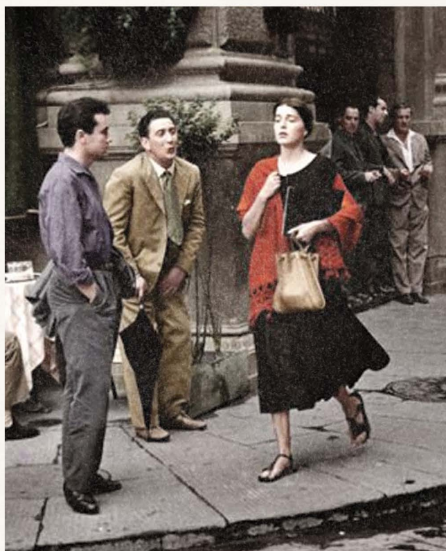
American girl in Italy (Ruth Orkin, 1951)